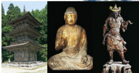
Three Story Pagoda Statue of Amitabha Twelve Heavenly Generals

The temple has been said to be built in 746 by Bodhisena, an Indian Buddhist, with an order of Emperor Seimu. Received good supports from leaders in capital cities in the Heian and medieval eras, the temple had become the largest in Tohoku area in the Edo era.